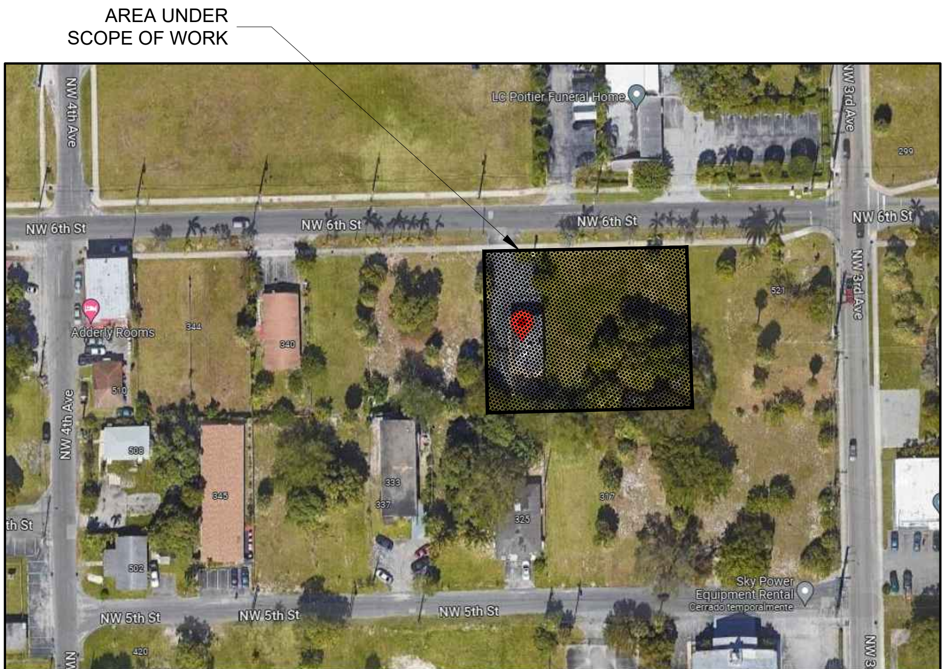
AERIAL VIEW SCALE: N.T.S